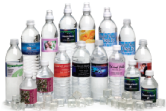
Water Bottle Labels

The LX810 prints onto many different label and tag materials, including inkjet coated high-gloss, semi-gloss and matte labels. Labels printed on high-gloss material are highly scratch- and smudge-resistant and virtually waterproof. This is a perfect solution for primary or box labels that can be exposed to water, rain and snow.