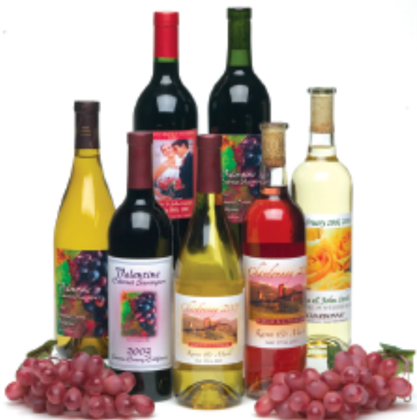
Wine Bottle Labels

The LX810 produces gorgeous, professional-quality labels for all your short-run, specialty products. It is also perfect for a host of other uses such as proofing before going to press on longer runs. Test marketing. Contract manufacturing. Private label goods. Promotional labels. Full-color box-end labels with all the required bar codes. And much more.