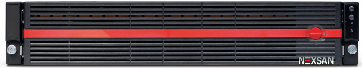
NEXSAN NST6000MC CONTROLLER NODE™