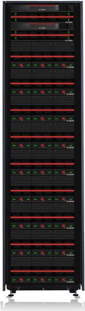
Figure 2 NST6530 with Nexsan E-Series SAS Storage Arrays in a 42U rack.