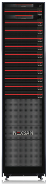
Figure 3 NST6530 with Nexsan NST224X SAS Storage Enclosures in a 42U rack.