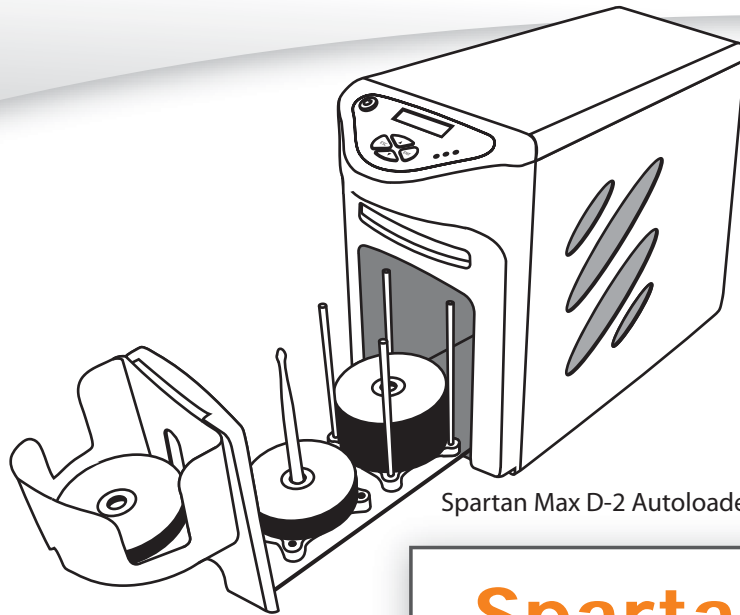
Spartan Max D-2 Autoloader

ILY Enterprise, Inc. Attn: Rebate Dept. 783 Phillips Drive City of Industry, CA 91748